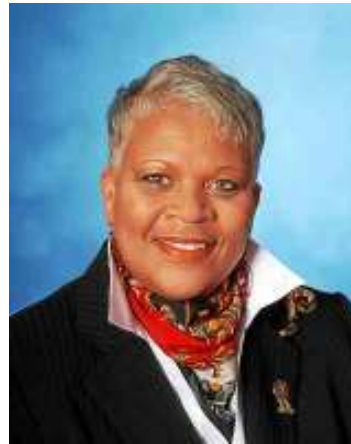
Councilwoman Patrice Waterman