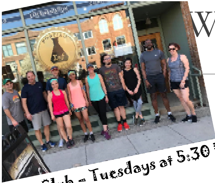
Run Club - Tuesdays at 5:30 PM