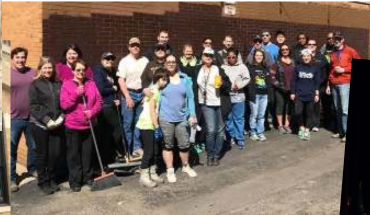
Earth Day Clean Up!