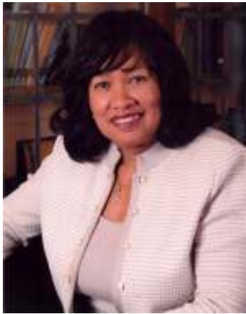
Mayor Deirdre Waterman