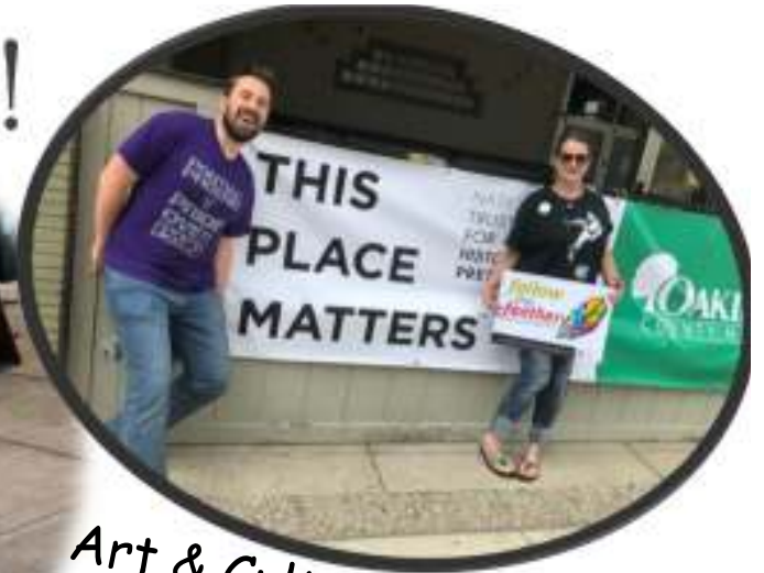
Art & Culture Crawl!